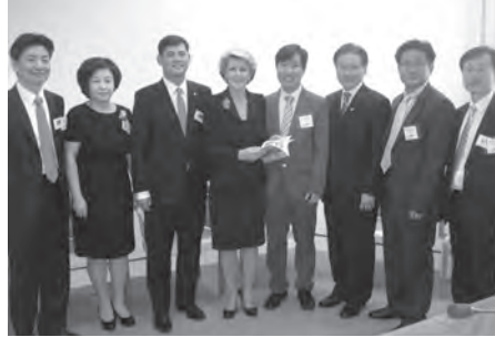
The fourth delegation from the Republic of Korea with the Hon Julie Bishop MP, Minister for Foreign Affairs, Federal Member for Curtin