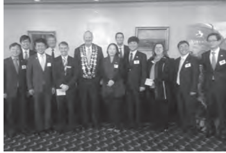
The fifth delegation from Republic of Korea with members of Banyule City Council