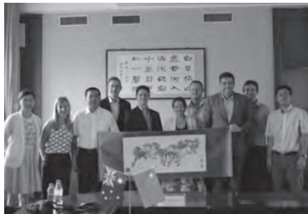
The twenty-second Australian delegation to the People's Republic of China with representatives of the All-China Youth Federation