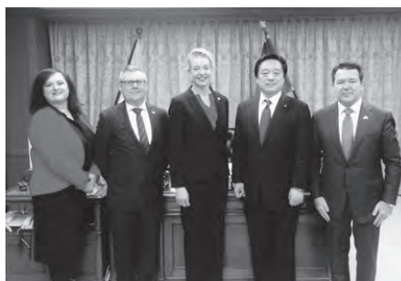
The twenty-fourth Australian delegation to Japan with Mr Kenji Wakamiya MP, State Minister for Defence