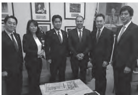
The fifteenth delegation from Japan with the Hon Josh Frydenberg MP, Minister for Resources, Energy and Northern Australia, Federal Member for Kooyong