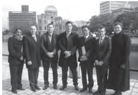
The twenty-second Australian delegation to Japan visiting the Hiroshima Peace Memorial