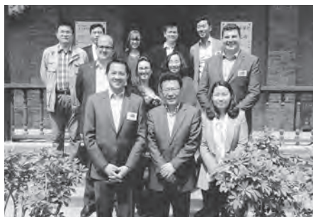
The twenty-third Australian delegation to the People's Republic of China with scholars of the National Institute of International Strategy, Chinese Academy of Social Science