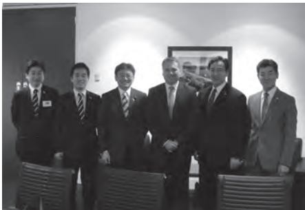
The thirteenth delegation from Japan with the Hon Jamie Briggs MP, Assistant Minister for Infrastructure and Regional Development, Federal Member for Mayo