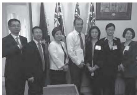
The twenty-third delegation from the People's Republic of China with the Hon Mal Brough MP, Minister for Defence Material and Science, Special Minister of State, Minister with portfolio responsibility for the Australian Political Exchange Program, Federal Member for Fisher