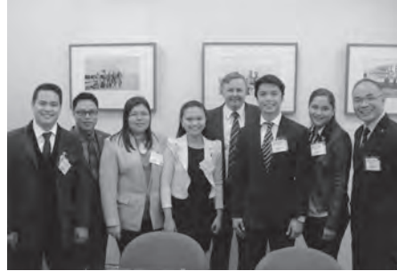
The seventh delegation from the Philippines with the Hon Anthony Albanese MP, Shadow Minister for Infrastructure and Transport, Shadow Minister for Tourism, Federal Member for Grayndler