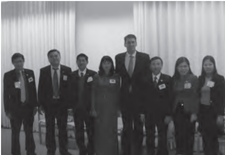
The eighteenth delegation from the Socialist Republic of Vietnam with Senator Cory Bernardi, Senator for South Australia