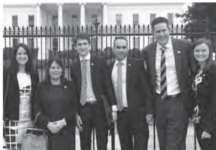
The thirty-first Australian delegation to the United States of America outside of The White House in Washington DC