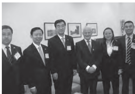
The twenty-second delegation from the People's Republic of China with the Hon Philip Ruddock MP, Chief Government Whip, Chair of the Australia-China Friendship Group, Federal Member for Berowra