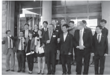
The fourth Australian delegation to the Republic of Korea with members of the Korean Youth Committee