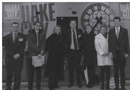
The tenth Australian delegation to New Zealand at Quake City in Christchurch