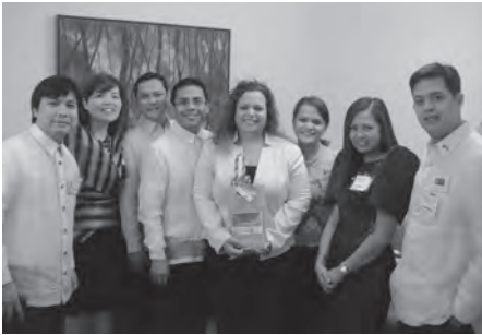
The eighth delegation from the Philippines with Ms Michelle Rowland MP, Shadow Minister for Citizenship and Multiculturalism, Shadow Assistant Minister for Communications, Federal Member for Greenway