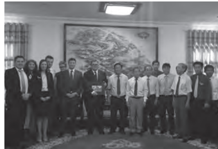
The nineteenth Australian delegation to the Socialist Republic of Vietnam with representatives from Ho Chi Minh Communist Youth Union