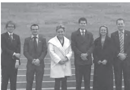
The tenth Australian delegation to New Zealand at the steps of Parliament House