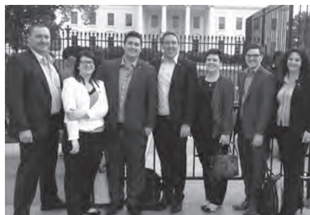
The thirtieth Australian delegation to the United States of America in front of the White House