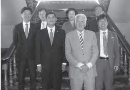
The fourth delegation from the Republic of Korea with Alderman Damon Thomas, Lord Mayor of Hobart