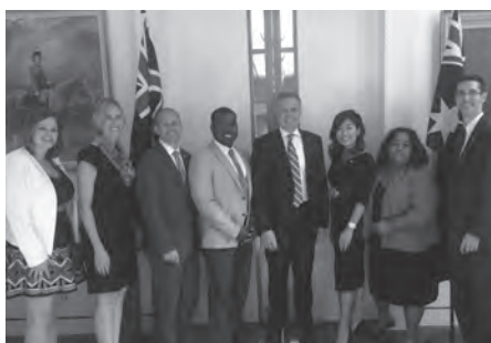
The thirty-second delegation from the United States of America with the Hon Tony Smith MP, Speaker of the House of Representatives and Patron of the Australian Political Exchange Council