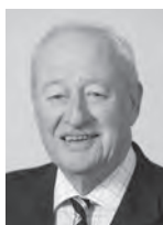
The Hon Alan Ferguson