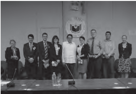
The seventh Australian delegation to the Philippines with Senator Paolo Benigno “Bam” A. Aquino IV