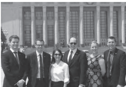
The twenty-fourth Australian delegation to the People's Republic of China outside the Great Hall of the People in Beijing