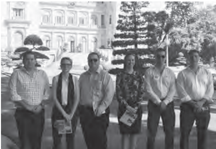
The nineteenth Australian delegation to the Socialist Republic of Vietnam outside the Independence Palace in Ho Chi Minh City