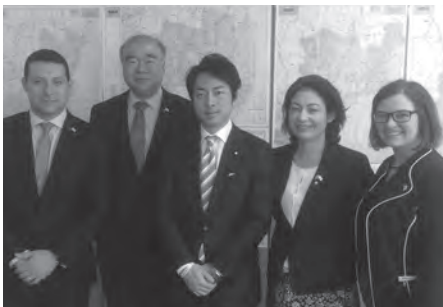
The twenty-third Australian delegation to Japan with Mr Shinjiro Koizumi MP, Parliamentary Vice-Minister for Reconstruction