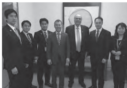
The fifteenth delegation from Japan with the Hon Warren Entsch MP, Chair, Japan Australia Parliamentary Friendship Group, Federal Member for Leichardt and Mr Nick Champion MP, Shadow Parliamentary Secretary for Manufacturing, Deputy Chair, Japan Australia Parliamentary Friendship Group, Federal Member for Wakefield