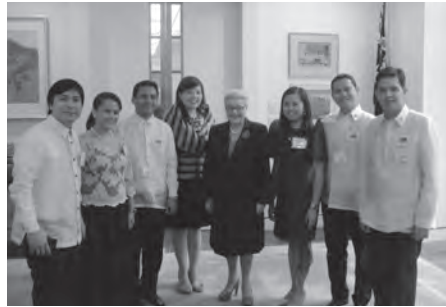
The eighth delegation from the Philippines with the Hon Bronwyn Bishop MP, Speaker of the House of Representatives, Patron of the Australian Political Exchange Program