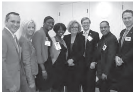
The thirtieth delegation from the United States of America with Senator the Hon Jan McLucas, Shadow Minister for Housing and Homelessness, Senator for Queensland