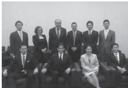
The twenty-third Australian delegation to Japan with members of the Japan-Australia Parliamentarians' Friendship League