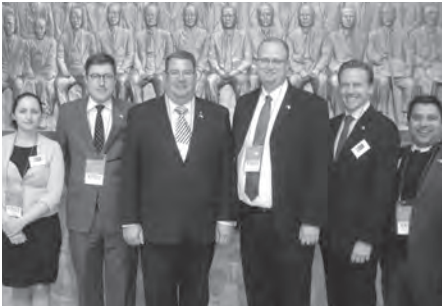
The fourth Australian delegation to the Republic of Korea at the National Assembly in Seoul