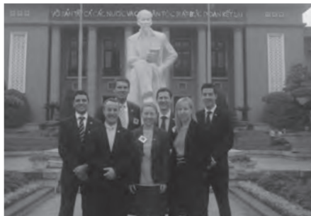
The eighteenth Australian delegation to the Socialist Republic of Vietnam