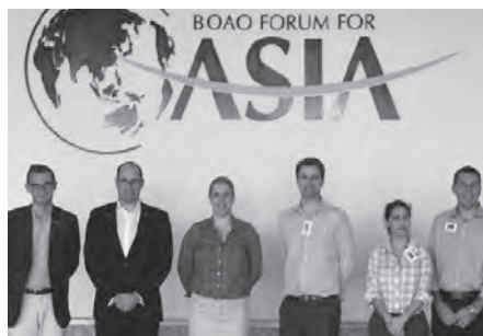
The twenty-fourth Australian delegation to the People's Republic of China visiting the Boao Forum for Asia site