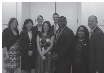
The thirty-second delegation from the United States of America with Senator Sarah Hanson-Young, Senator for South Australia, Council Member