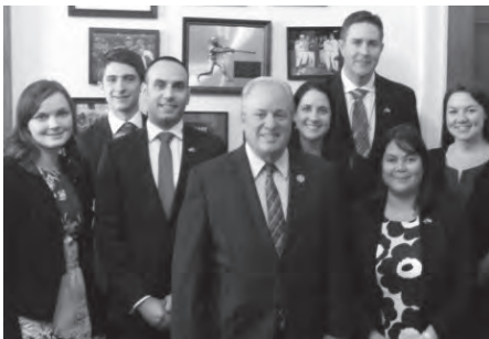
The thirty-first Australian delegation to the United States of America with Congressman Mike Doyle, the US Representative for Pennsylvania's 14th congressional district in his Capitol Hill Office in Washington DC