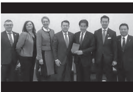
The twenty-fourth Australian delegation to Japan with members of the Japan-Australia Parliamentarians' Friendship League