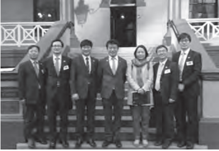
The fifth delegation from Republic of Korea outside Parliament House in New South Wales