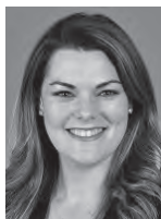
Senator Sarah Hanson-Young