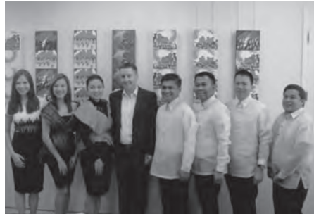
The ninth delegation from the Philippines with the Hon Mark Butler MP, Shadow Minister for Environment, Climate Change and Water, Federal Member for Port Adelaide